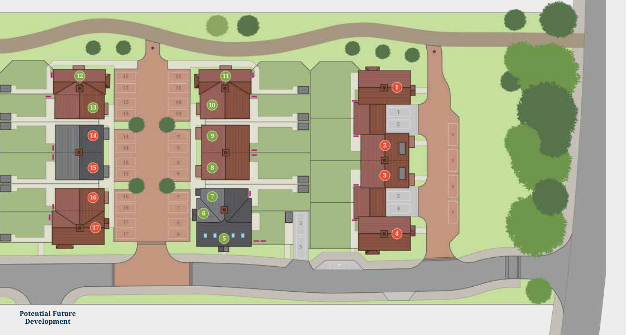
Potential Future Development