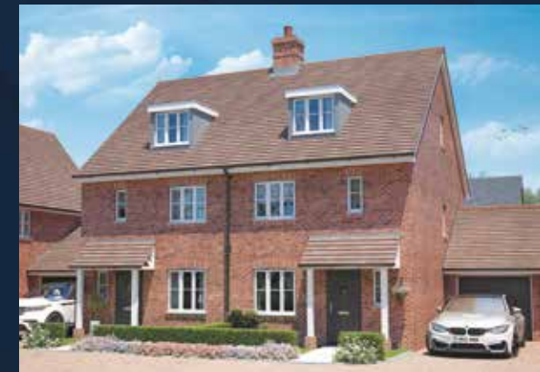
Plots 2 & 3

Above all, as with every home we build, these are properties that appeal to the heart as much as they do to the head. From the moment you set foot in Saint George's Park, you'll feel utterly at home.