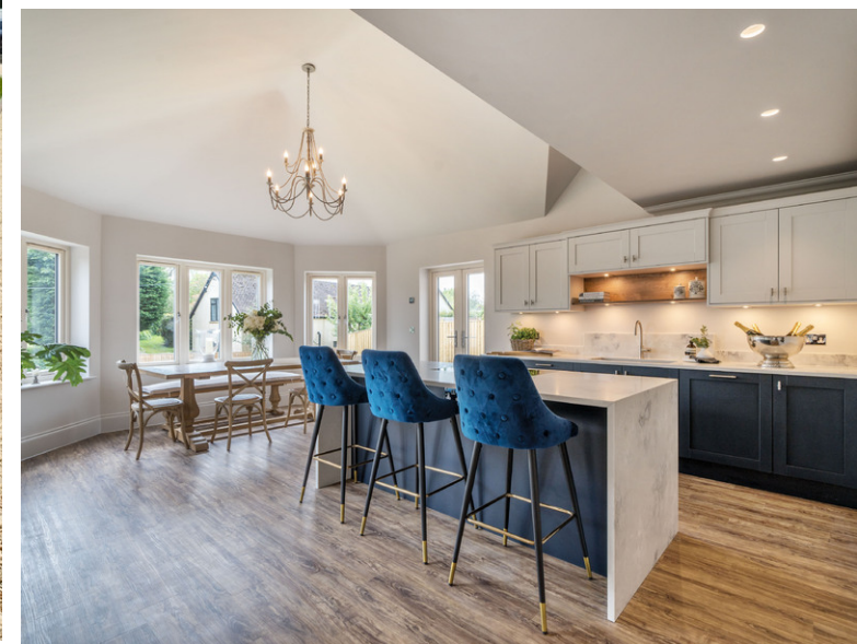
2 Appleyard Close, Whitchurch, Aylesbury, Buckinghamshire, HP22 4FX