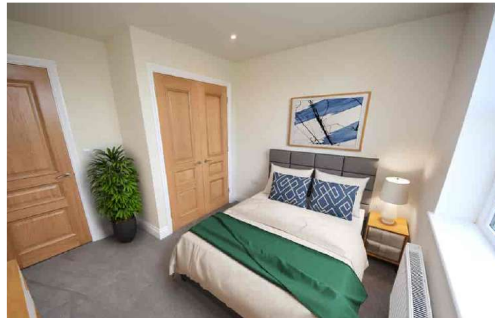
8 The Old Elephant & Castle, Causeway, Banbury, Oxfordshire. OX16 4SN Guide Price £247,000 - Share of Freehold