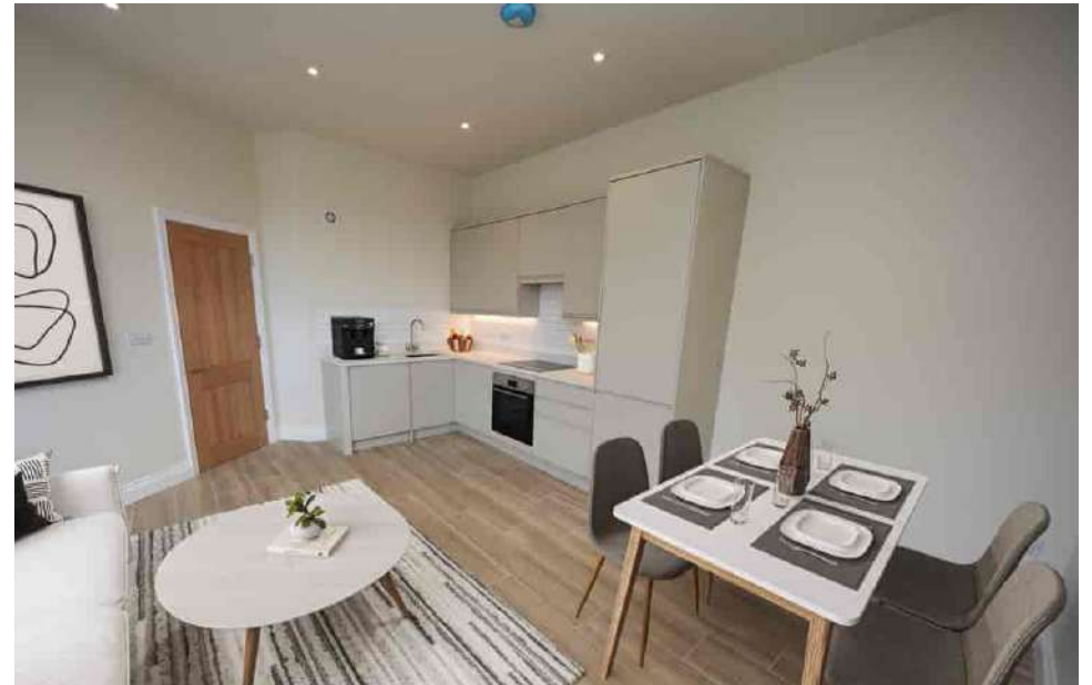
4 The Old Elephant & Castle, Causeway, Banbury, Oxfordshire. OX16 4SN Guide Price £250,000 - Share of Freehold